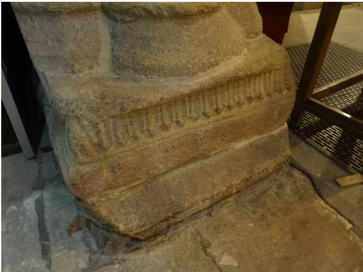
The base of the column at the very west end of the church

All that remains are the tops (the capitals) of two columns which have been incorporated into the early-1300s building by turning them upside-down and using them as columns bases. Their locations are indicated in red on the plan of the church shown earlier.