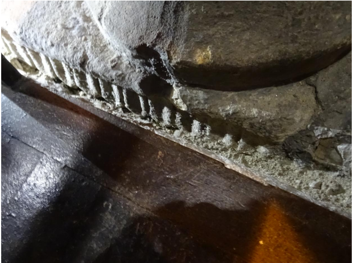
The base of the 4 th column from the west end (with thanks to Chris Wright)

Note: The base of the column at the very west end of the church is quite easily seen; the base of the 4th column is more difficult as it is largely below the level of the wooden platform that supports the pews. Both have the same decoration.